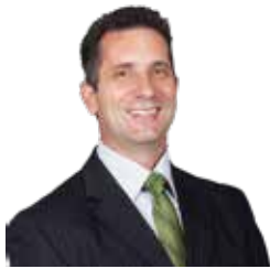
Hon. Paul Papalia CSC, MLA Minister for Tourism

The McGowan Government is a proud sponsor of Channel 7 Mandurah Crab Fest through Tourism WA's Regional Events Program.