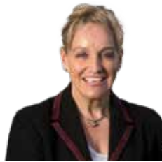
Hon. Alannah MacTiernan MLC Minister for Regional Development

The Regional Events Program plays an important role in positioning Western Australia as an exciting destination to visit and a great place to live by showcasing and promoting a region's unique and diverse attractions.